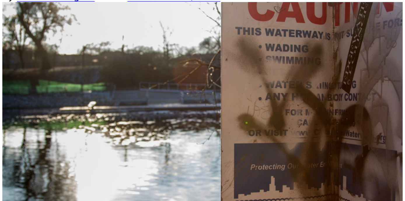
Sign alongside the Chicago River North Branch, River Park, Chicago.